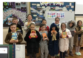
AR raffle winners