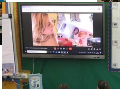
Sophie Dahl reading her latest book to Y5