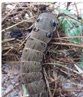
Elephant Hawk Moth Caterpillar