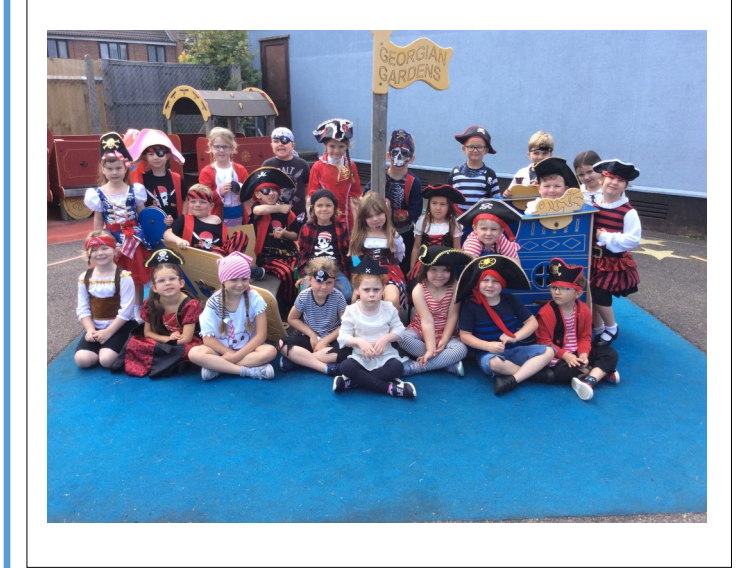
YR pirate day—don't they all look great?