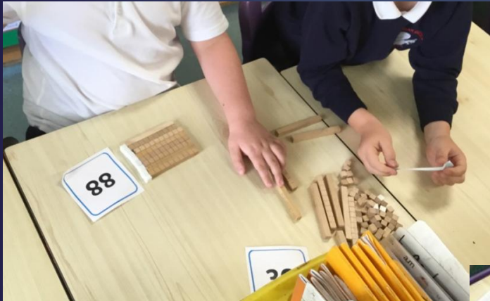
Year 1 used tens and ones to make two digit numbers